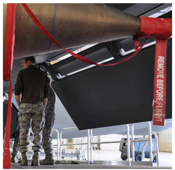
Above - Master Sgt. Shaun Loeffler, 507th maintenance squadron ISO dock coordinator stands under the wing of a KC-135 stratotanker during installation of the new KC-135 maintenance platforms. The new platforms are expected to cut down inspection times and increase safety. See story page 2. Left - 1st Sgt. Joseph Lepine, 507th Air Refueling Wing aircraft maintenance squadron, see story page 1, loads deployer's baggage on the trucks prior to loading on a KC-135. Over 130 members of the 507th deployed to Southwest Asia.